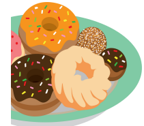
GOODIES WITH GRANDS