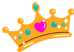
TIES AND TIARAS EVENT