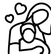
MOTHER AND SON EVENT

Look for more info on these events, VOLUNTEER opportunities and more in our upcoming newsletters and facebook page!