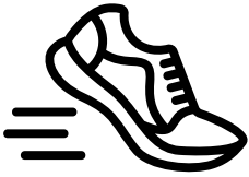
RUN FOR FUN

WE LIKE TO TRY TO KEEP IT SIMPLE ON THE FUNDRAISING. WE HAVE A RUN FOR FUN AT THE BEGINNING OF THE YEAR THAT HOPEFULLY WILL BE A “ONE AND DONE” TO KEEP IT SIMPLE FOR PARENTS. BUT OF COURSE, WE COULDN’T DISAPPOINT OUR NORTHFIELD FAMILIES, WE ARE STILL GOING TO BE SELLING THE BELOVED CANDLES DURING THE FALL AND SPRING. WE ALSO HAVE THINGS WE DO JUST FOR THE KIDS LIKE BOOKFAIR AND HOLIDAY SHOP, ASSEMBLIES, FUN’N’STUFF AND MORE.